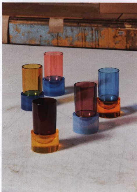
↑ A FORAY INTO GLASS AND RESIN BY DESIGN STUDIO OBJECTS OF COMMON INTEREST, SEE PAGE 073

140 | Guiding forces A life-changing year in the Rolex Mentor and Protégé Arts Initiative